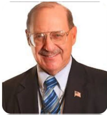
BS, DVM, ND Founder of Epigenetics